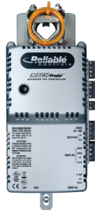
1,020 MACH-ProAir™ controllers