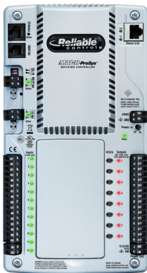
5 MACH-ProSys™ controllers

A custom combination of mechanical cooling strategies and natural ventilation from windows in different areas of the buildings dramatically cuts energy consumption and saves annual cooling costs by an estimated 80 percent per year compared to conventional approaches.