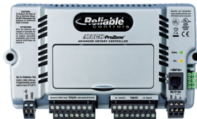
31 MACH-ProZone™ controllers