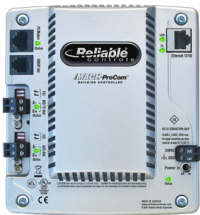
25 MACH-ProCom™ controllers