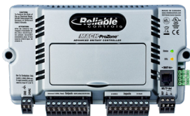
115 MACH-ProZone™ controllers

With more than 110 air-handling units on site, facility operation is a complex task. The simple system integration empowered by RC-Studio and the ability to use RC-WebView for remote access and control provided improved operation, cost savings, and shorter response times for building operators. ICCE developed a custom graphical interface that makes it effortless for airport managers to diagnose issues and spot inefficiencies at a glance.