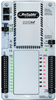
4 MACH-Pro1™ controllers