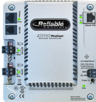
5 MACH-ProCom™ controllers