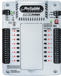
3 MACH-ProPoint™ Output expansion modules