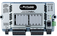
33 MACH-ProZone™ controllers