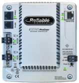
7 MACH-ProCom™ controllers