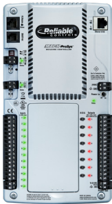
2 MACH-ProSys™ controllers