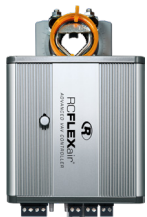
6 RC-FLEXair™ controllers